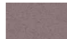
HEATHER E080/ E081 /E082