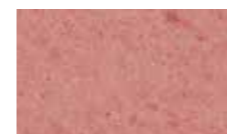
RED E010/ E011 /E012

If the colour you require is not shown, simply contact our technical department to arrange a trial mix to meet your colour specification.