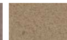
BUFF E180/ E181 /E182