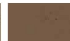
STRAW - BROWN E100/ E101 /E102